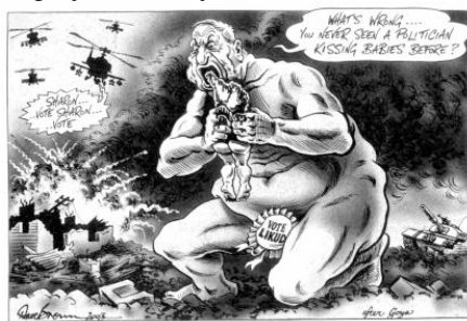
Israel's former Prime Minister Sharon eats Palestinian babies.